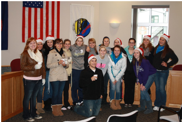
Thank you Otsego Students for Volunteering