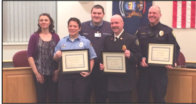
Life Saving Awards Presented at the City Commission Meeting, Monday, March 3, 2014