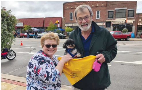
Pet Mayor Election