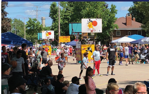
Gus Macker Tournament