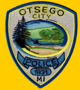
Police Chief, Bradley E. Misner

As we replace our beach bags full of toys for backpacks full of books, we would like to remind you, now that school is back in session and traffic is a little heavier on our streets, student safety becomes a community-wide role. Be vigilant and alert behind the wheel. Watch for students walking or riding bicycles to/from school and/or bus stops.